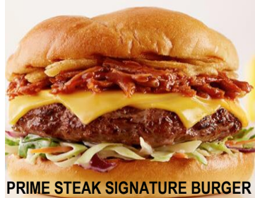
PRIME STEAK SIGNATURE BURGER

SIGNATURE BURGER ½ POUNDER 12.95 TOPPED WITH DAMONS FAMOUS BOURBON GLAZE RIBS, JACK CHEESE, LITTLE GEM & HOUSE RELISH