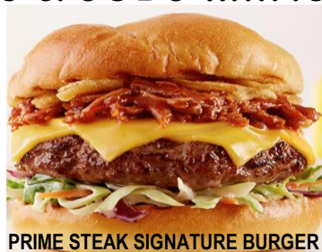
PRIME STEAK SIGNATURE BURGER

¼ LB STEAK BURGER SERVED WELL DONE ½ LB STEAK BURGER SERVED MEDIUM OR WELL DONE