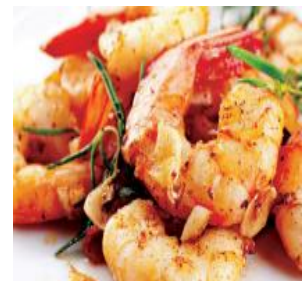
PAN FRIED JUMBO KING PRAWNS