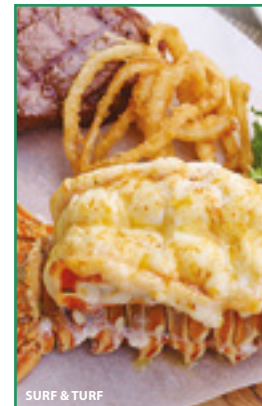
SURF & TURF