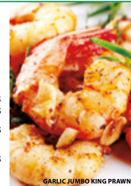
GARLIC JUMBO KING PRAWNS

CRISPY BATTERED PRAWNS 10NO 13.45 IN LIGHT BATTER & DIPPING SAUCE